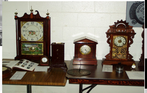
Some of the display clocks from April's meeting.