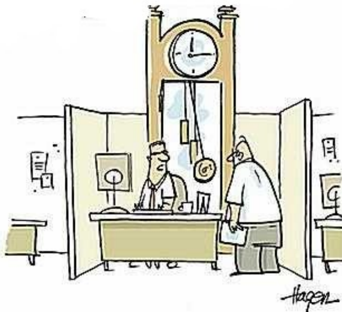
IT LOWERS MY BLOOD PRESSURE.

Our February Meeting was well-attended and even the weather managed to cooperate! The Silent Auction was busy as usual. The presentation consisted of a video from National about the monumental Engel Clock. The video was very interesting as it showed not only the various functions and animations of the clock, but also showed some of the restoration process. This incredible clock, owned by our organization is a highlight of our museum in Columbia. If you get a chance to visit, be sure to check when they demonstrate the clock. It is well worth waiting for!