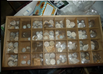
Chest featuring over 4,000 watch crystals. They appear to be all sorted by size.