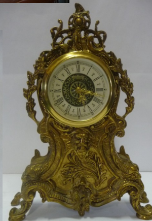
Top Left: Gilt Boudoir Clock