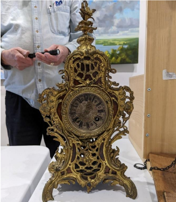
Lenzkirch cast gilded bronze. The result of the ongoing development of clock making as an industry that got its start with handmade and hand carved wooden clocks.

THE NEWSLETTER OF THE TORONTO CHAPTER OF NAWCC MEETINGS ARE AT The Neilson Park Creative Centre 56 Neilson Park Drive in Etobicoke