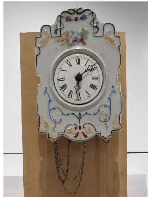
Porcelain Jockele circa 1850. Often see in miniature form