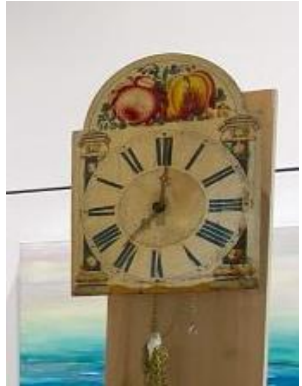
Early shield clock Wood plates and wheel works