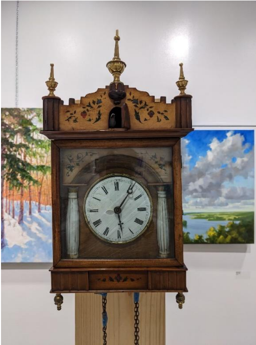
Very early Beha cuckoo, wood plate for domestic and export markets

THE NEWSLETTER OF THE TORONTO CHAPTER OF NAWCC MEETINGS ARE AT The Neilson Park Creative Centre 56 Neilson Park Drive in Etobicoke