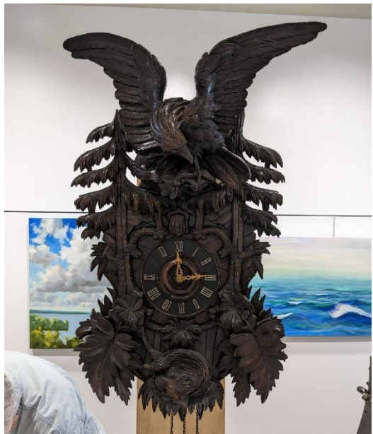
Highly carved example of a non hunter style cuckoo clock