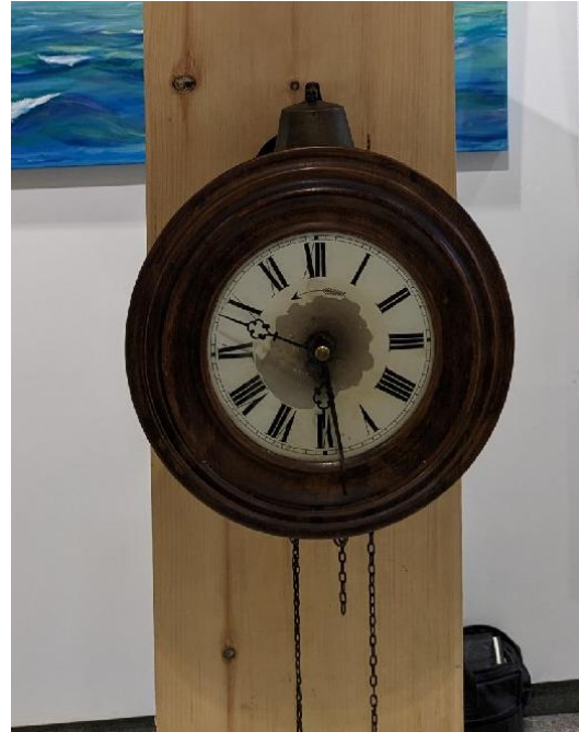
Postman's clock, wooden plates for export market