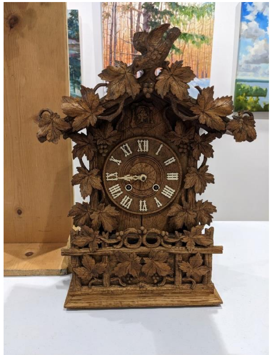
Beha fusee table top cuckoo clock

Russ provided detailed descriptions of the many styles of clocks on display interspersed with observations and personal recollections of his tour of the area 2015.