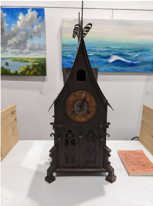
This clock was entirely of metal constructed by hand. Brass plated fusee movement.