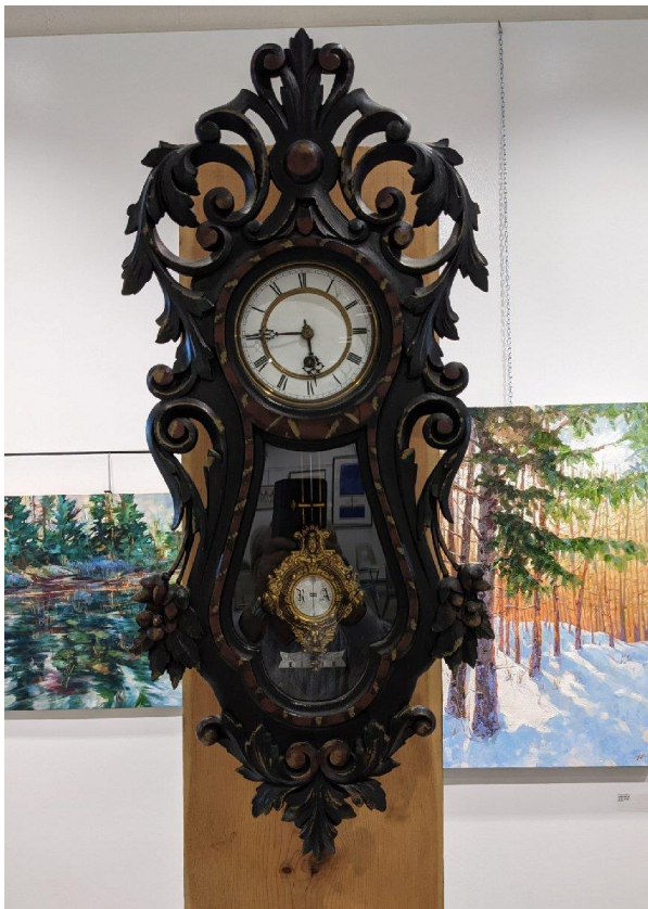
Typical black forest carved "Vienna" Lenzkirch